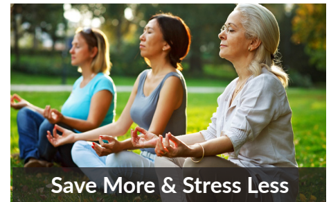
Save More & Stress Less

April is Financial Literacy Month and Stress Awareness Month so get your mind and body in shape as well as your finances with these savings: